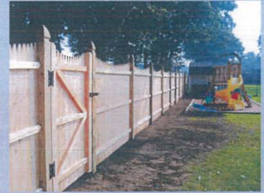
An example of an structural side facing inward.

All fences need to present the non-structural face outward.